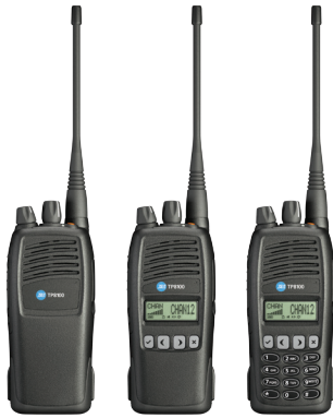
TP8110 TP8115/35 TP8120/40