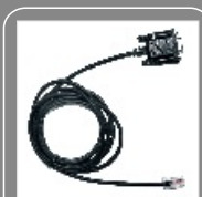
Programming cable PC21