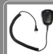
Palm microphone SM07R2