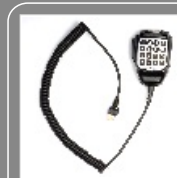
Keypad microphone SM07R1