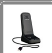
Desktop Microphone SM10R2