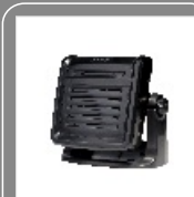
External speaker SM09S2